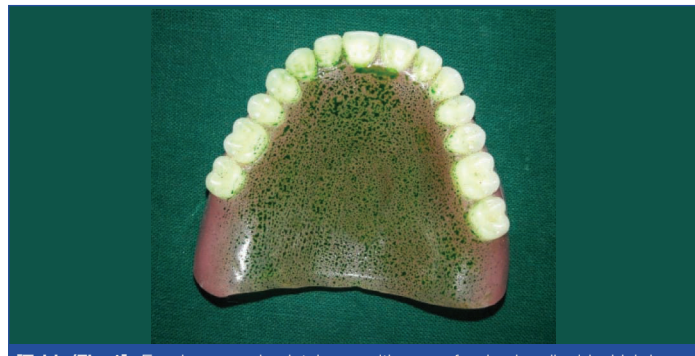
[Table/Fig-1]: Evenly sprayed palatal area with green food colour liquid which immediately dries.

Next the maxillary complete denture was evenly and uniformly sprayed with green coloured liquid, obtained by mixing edible food colours [Table/Fig-1]. Green colour was specifically chosen, as it imparted visually appreciable contrast against denture base. It was then inserted in patient's mouth and correctly seated, taking appropriate caution that the sprayed palate did not touch elsewhere, before the sound was pronounced. Patient was asked to repeat