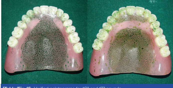
[Table/Fig-8]: Verified palatograms for "S" and "T" sounds.

Anterior teeth positioning, occlusal plane, vertical dimension of occlusion and palatal contour altogether, work on tandem and ensure optimum phonetics in complete denture. Palatal contour thus remains as the sole factor influencing speech, when other three factors are physiologically and mechanically accurate or well compensated [2,3]. Proper pronunciations require accurate approximation of tongue with the palatal contour. Intelligible speech, especially the sibilant sounds, requires normal motor function of tongue musculature and a customized palatal contour having dynamic tongue impression. In treatment with complete dentures, aesthetics, function, retention and comfort are harped upon at every step of denture fabrication, but phonetics is more often than, mistakenly an ignored facet! [4,5].