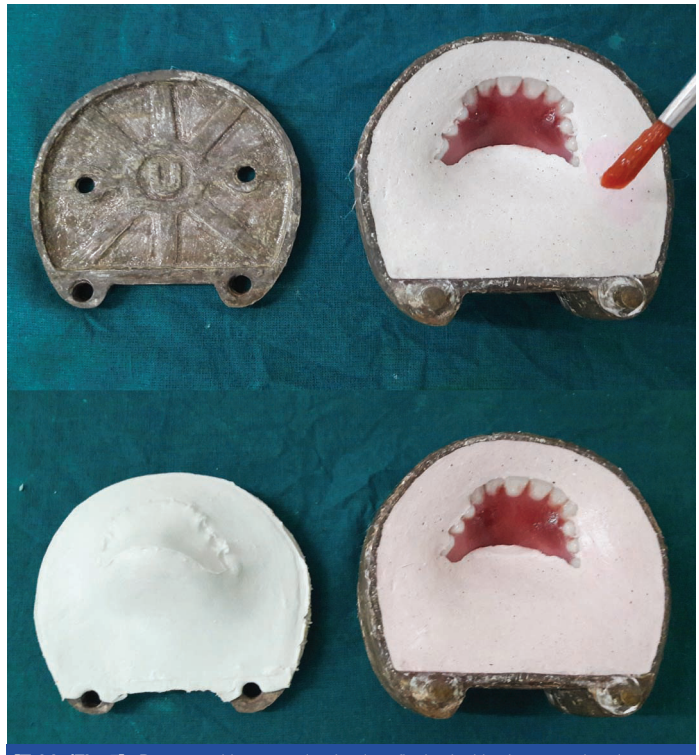
[Table/Fig-5]: Denture with customized palate flasked with plaster and a plaster key-way prepared.