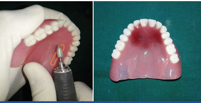
[Table/Fig-3]: Over contoured area is selectively trimmed. [Table/Fig-4]: Tissue conditioner with added red colour for contrast adapted to deficient area after prolonged speech.

insertion, patient was asked to repeat the defective sounds "so", "to", "sho" repeatedly for 10 minutes at a faster rate, so as to record the tongue activity during speech. The bulk of tissue conditioner was contoured to functional anatomy by tongue and a customized anterior palate was obtained [Table/Fig-4]. After validating the clarity of sibilant sounds, denture was removed from patient's mouth. Waxed trial denture was processed normally after this maneuver.